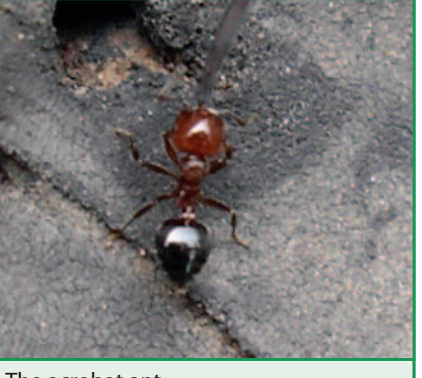
The acrobat ant.

Ants are constricted between the thorax and abdomen and have a "wasp waist." Their wings are