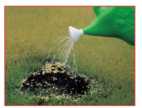
Most granular (non-bait) products contain an insecticide that releases into the soil when drenched with water.

• Granular products, which contain an insecticide that releases into the soil when water is applied. Sprinkle the recommended amount of insecticide on top and around the mound. Most products should then be watered into the mound with at least 1 to 2 gallons of water. A sprinkling can is best for gently washing chemicals into the nest without washing the granules off the mound. Do not use a hose for this purpose.