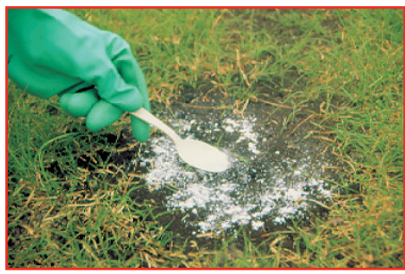
Dry dusts are convenient and easy to apply.