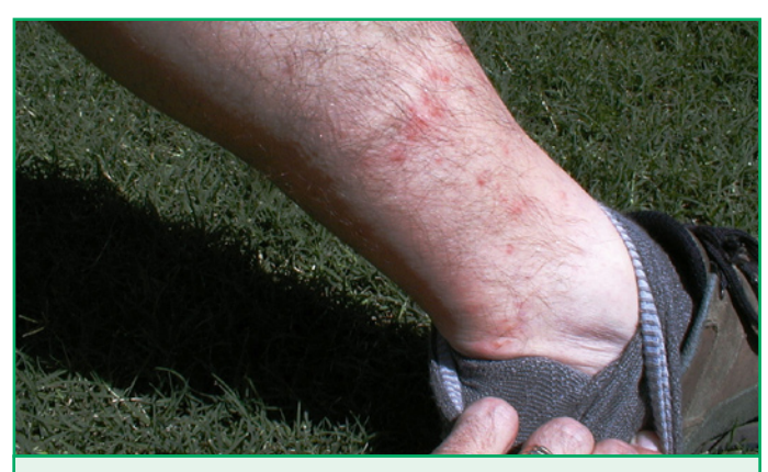
Chigger bites are most common on the lower parts of the body in areas of tight-fitting clothing, such as under socks.

Contrary to common belief, chiggers do not burrow into a host's skin or suck blood. They pierce the skin with their sharp mouthparts and inject a digestive enzyme, disintegrating skin cells for food. Itching usually begins within 3 to 6 hours after an initial bite, followed by development of reddish areas and sometimes clear pustules or bumps. As the skin becomes red and swollen, it may completely envelop the feeding